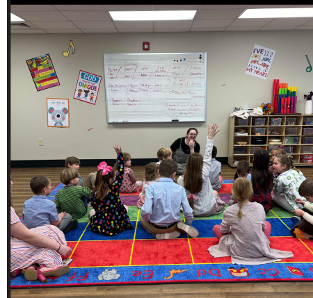
Repaired walls and painting in the Children's Music Room, WOW Room, Sanctuary, and stairway