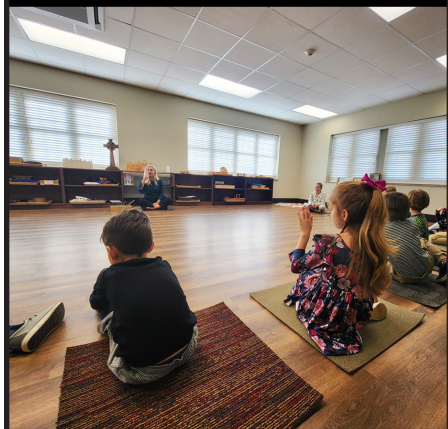
New flooring in the Children's Music and WOW Rooms