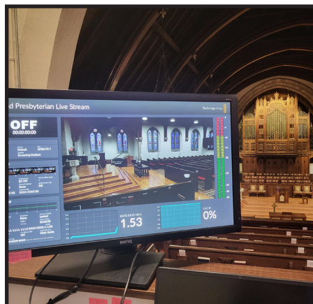
Sanctuary Audio-Visual Upgrades and Replacement