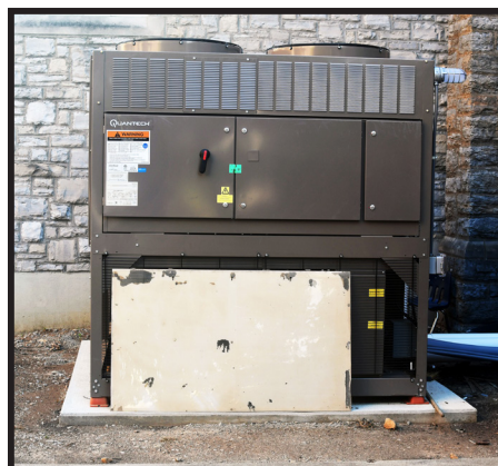
The new chiller for the boiler/chiller system